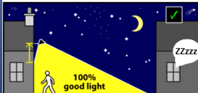
WELL AIMED 100W FLOODLIGHT