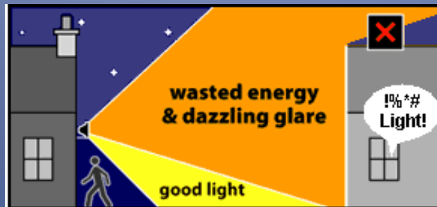
BADLY AIMED 500W HALOGEN FLOODLIGHT